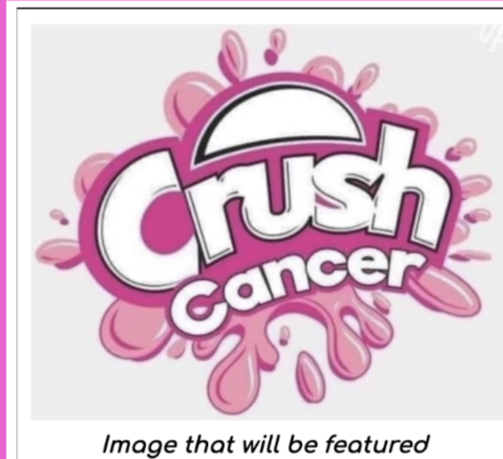
on all of the shirts