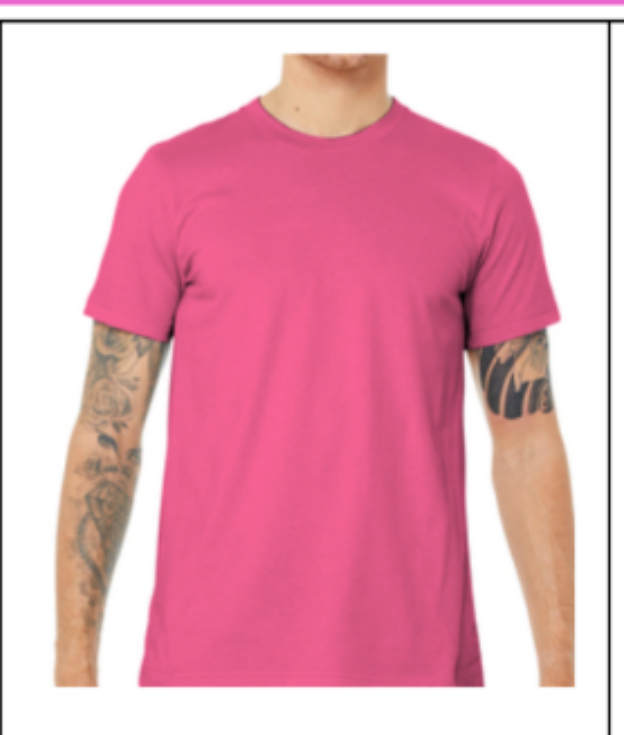
$20 T-Shirt $2.00 extra for sizes 2XL & 3XL